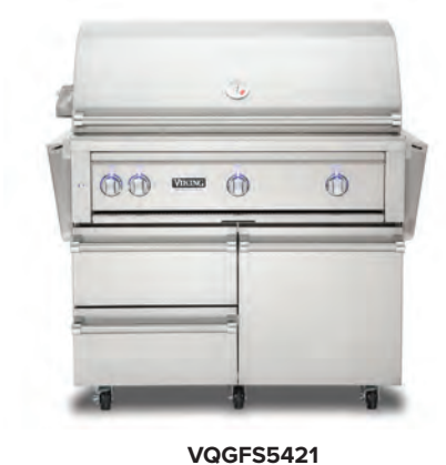
VQGFS Outdoor Gas Grills with Carts